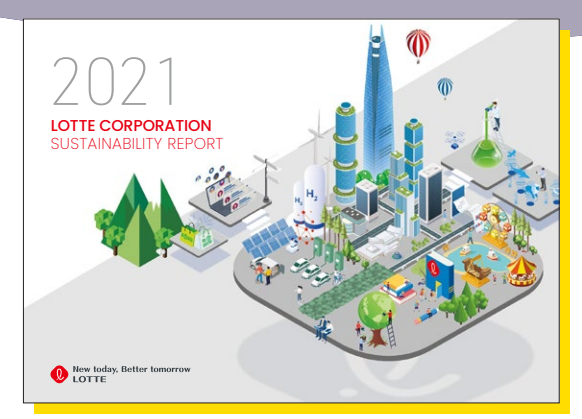
BEST OF ANNUAL REPORTS - Print Talantone Creative Group LOTTE CORPORATION 2021 Sustainability Report (SOUTH KOREA)