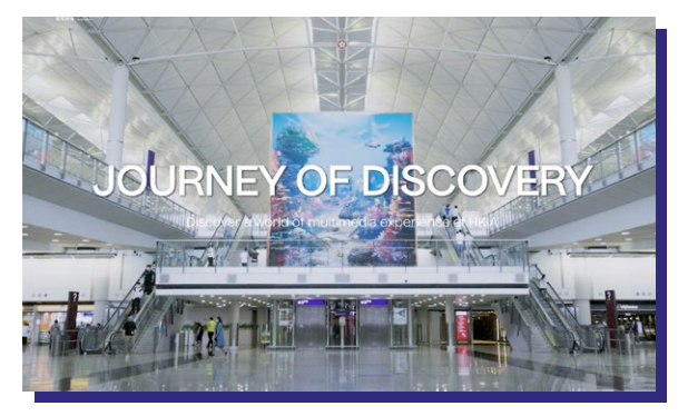
BEST OF MOBILE MEDIA Airport Authority Hong Kong ExperienceHKAirport.com – The website of "Journey of Discovery" (HONG KONG SAR PRC)