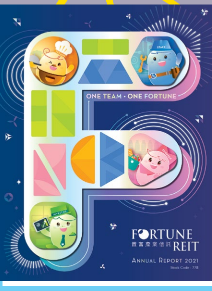
BEST OF DESIGN - Annual Reports & BEST OF DESIGN - Covers GenNex Financial Media Limited FORTUNE REAL ESTATE INVESTMENT TRUST One Team · One Fortune (HONG YONG SAR PRO)