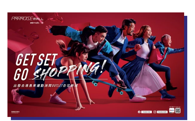
BEST OF ADVERTISING Havas Worldwide Hong Kong MTR CORPORATION LIMITED Get Set Go Shopping - Paradise Mall (HONG KONG SAR PRC)