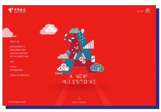
BEST OF WEBSITES China Telecom Corporation Limited A NEW MILESTONE (HONG KONG SAR PRC)