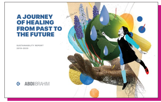
BEST OF ANNUAL REPORTS - Online EDITORYAL TASARIM LTD. STI. ABDI IBRAHIM ILAÇ SAN. A.S. Abdi Ibrahim Sustainability Report 2019-20 (TURKEY)