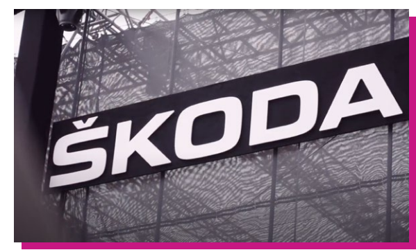
BEST OF SPECIAL EVENTS SCHACHZUG – Agentur für Markenkommunikation GmbH ŠKODA AUTO A.S. ŠKODA FABIA World Premiere (CZECH REPUBLIC)