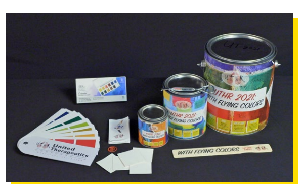
BEST OF COPYWRITING United Therapeutics/LAB 4 UTHR 2021 With Flying Colors (USA)