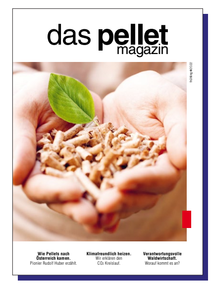
BEST OF DESIGN Bound Publications COPE Content Performance Group PROPELLETS AUSTRIA NETZWERK ZUR FÖRDERUNG DER VERBREITUNG VON PELLETSHEIZUNGEN das pellet (AUSTRIA)