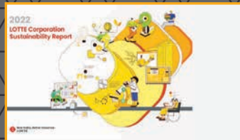
BEST OF SOUTH KOREA TALANTONE CREATIVE GROUP for LOTTE CORPORATION