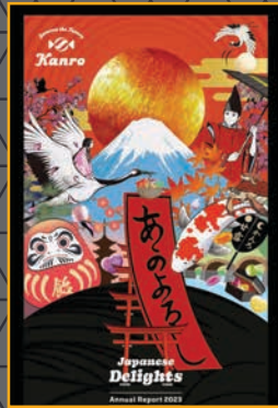
BEST OF JAPAN KANRO INC.