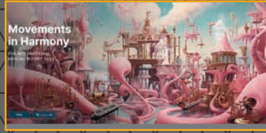
BEST OF SINGAPORE SILICONPLUS COMMUNICATIONS PTE LTD for PSA INTERNATIONAL PTE LTD