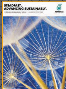
BEST OF MALAYSIA NOVA FUSION SDN BHD for PETRONAS CHEMICALS GROUP BERHAD