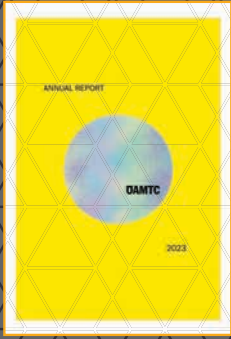
BEST OF AUSTRIA ÖAMTC