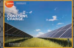
BEST OF INTERNATIONAL INSIGHT CREATIVE LTD. for GENESIS ENERGY (New Zealand)