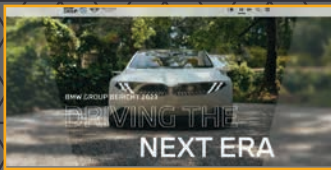
BEST OF GERMANY 3ST KOMMUNIKATION GMBH for BMW AG