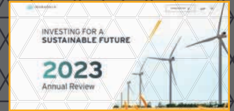
BEST OF MIDDLE EAST PUBLICIS SAPIENT for MUBADALA INVESTMENT COMPANY (United Arab Emirates)