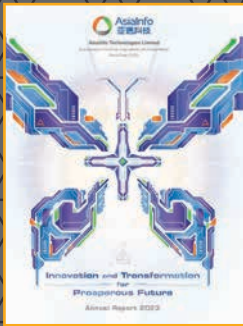
BEST OF PEOPLE'S REPUBLIC OF CHINA CRE8 (GREATER CHINA) LTD. for ASIAINFO TECHNOLOGIES LIMITED