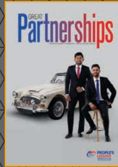
BEST OF SRI LANKA EMAGWISE (PVT) LIMITED for PEOPLE'S LEASING & FINANCE PLC