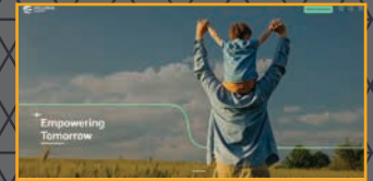
BEST OF EUROPE HELLENIQ ENERGY HOLDINGS S.A. (Greece)