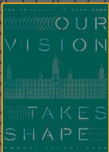
BEST OF HONG KONG SAR THE UNIVERSITY OF HONG KONG