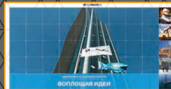
BEST OF ASIA FANDA CORPORATE COMMUNICATIONS LTD. for JSC NC KAZMUNAYGAS (Republic of Kazakhstan)