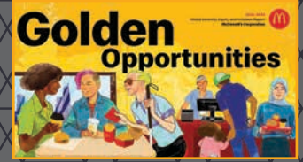
BEST OF USA AVILA CREATIVE for McDONALD'S CORPORATION