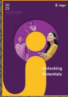
BEST OF INDONESIA MITRAGRAFIA (PT MITRA GAGASEMHA KREASI) for PT BANK JAGO TBK