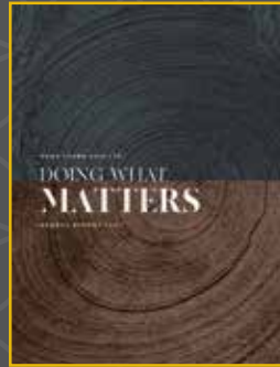
BEST OF SINGAPORE META FUSION PTE LTD for HONG LEONG ASIA LTD.