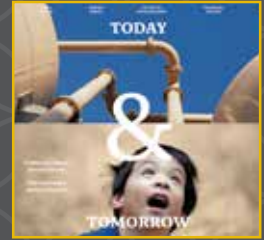
BEST OF USA CALIFORNIA WATER SERVICE GROUP