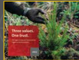
BEST OF EASTERN EUROPE STUDIO KERNEL D.O.O. for ZAVAROVALNICA TRIGLAV D.D (Slovenia)