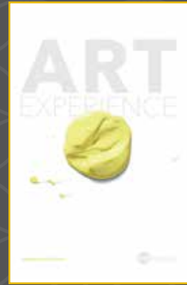
BEST OF WESTERN EUROPE VP BANK LTD (Liechtenstein)