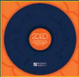
BEST OF CHINA TOPPAN MERRILL LIMITED for HARBIN BANK CO., LTD.