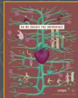
BEST OF THE AMERICAS EMPRESAS CMPC (Chile)