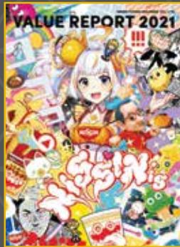
BEST OF JAPAN SHIAN INC. for NISSIN FOODS HOLDINGS CO., LTD.