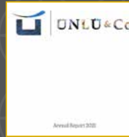
BEST OF TURKEY FİNAR for ÜNLÜ & CO.