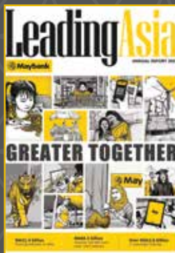
BEST OF MALAYSIA MALAYAN BANKING BERHAD