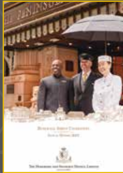
BEST OF HONG KONG IONE FINANCIAL PRESS LIMITED for THE HONGKONG AND SHANGHAI HOTELS, LIMITED