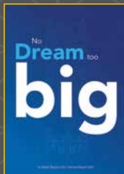
BEST OF SRI LANKA SRI LANKA TELECOM PLC