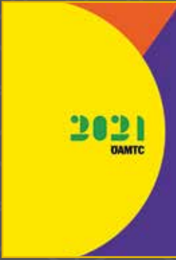
BEST OF AUSTRIA ÖAMTC