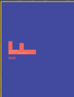
BEST OF GERMANY MUEHLHAUSMOERS CORPORATE COMMUNICATIONS GMBH for KÖLNER FREIWILLIGEN AGENTUR E. V.